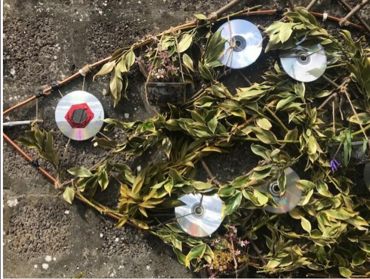
5. Silver is really taking shape now..CDs and plants!