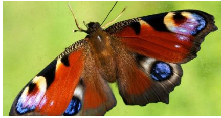
P4 – Eyes, butterflies and symmetry

Why do some butterflies appear to have eyes on their wings?